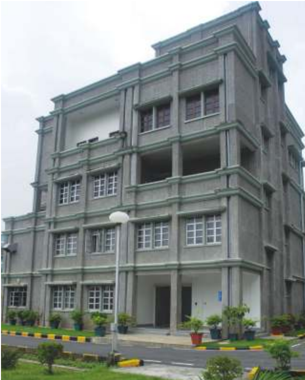
CSSTEAP HQ Dehradun

capability in the Asia-Pacific countries for research and applications in the core disciplines of Remote Sensing & Geographic Information System, Satellite Communications, Satellite Meteorology & Global Climate, Space & Atmospheric Science and Global Navigation Satellite System (GNSS). The educational programs, with course curricula developed by the United Nations, are recognized by Andhra University, Visakhapatnam, India for award of M.Tech degree. About 1864 professionals from 51 countries within and outside the Asia-Pacific region have graduated so far from the centre. For further details you may please visit www.cssteap.org .