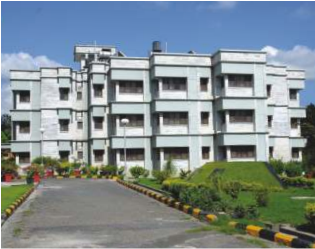
CSSTEAP hostel at IIRS