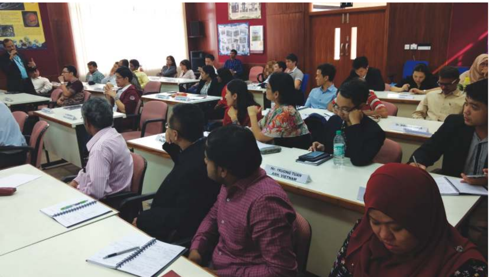
SSM 2016 course participants in classroom

List of selected participants will be hosted on CSSTEAP website ( www.cssteap.org ).